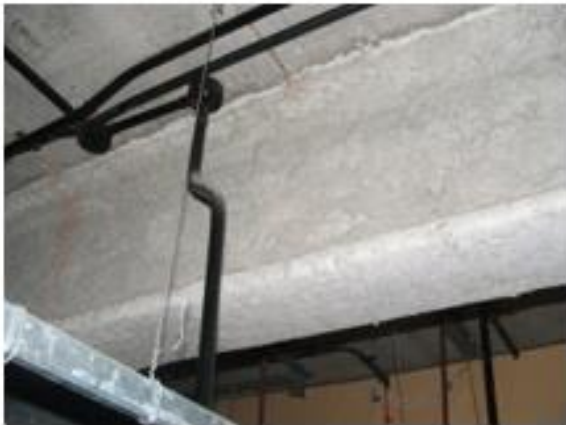
Sprayed finish on beams in ceiling void