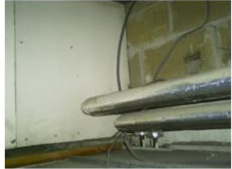
Broken and damaged AIB panels