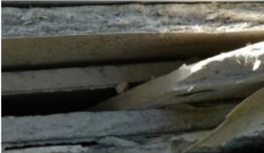
AIB panel firebreak in void space