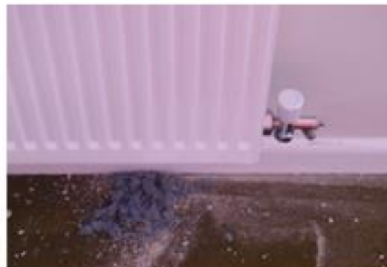
Blue asbestos cavity insulation exposed by fitting radiators