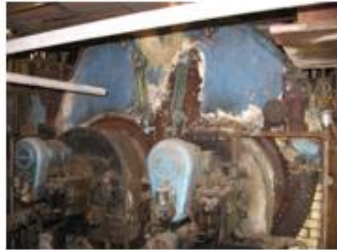
Damaged asbestos insulation on a boiler