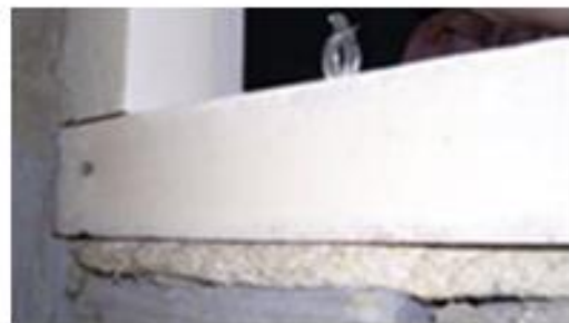
Asbestos rope packing under doorframe