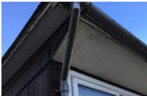
Roof soffits made of AIB panel