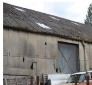
Asbestos sheeting and downpipes