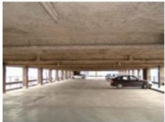
Sprayed asbestos fire protection on concrete structures