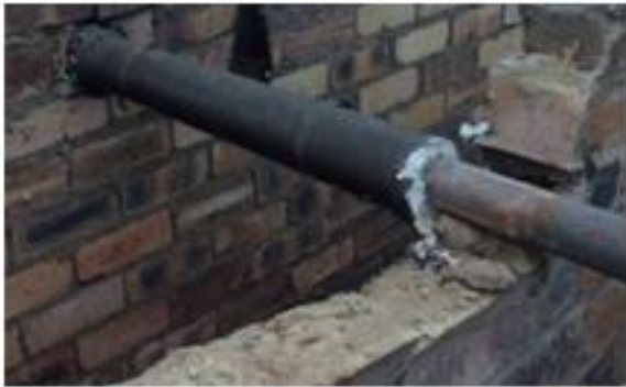
Damaged asbestos pipe lagging