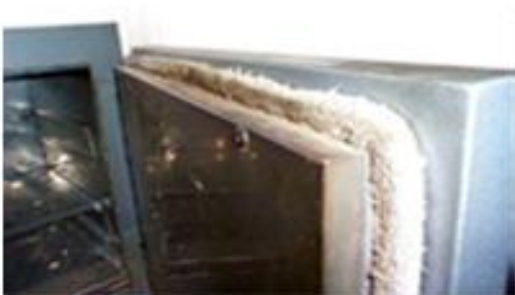
Asbestos rope seal on drying oven