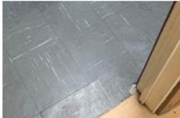
Asbestos in old floor tiling