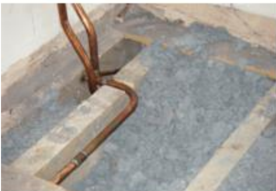
Loose blue asbestos fibre as underfloor insulation