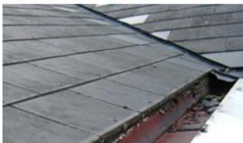
Roof tiles containing asbestos