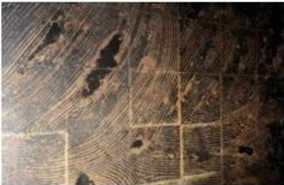
Asbestos in bitumen adhesives