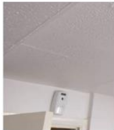
Textured finish over AIB panels